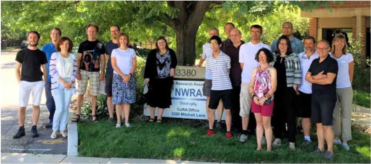
Figure 5: Group photograph of the OCTAV-UTLS Workshop participants in front of NWRA Boulder office.

climate and reanalysis models. The necessity of addressing uncertainties in the UTLS is demonstrated by much larger differences between models and observations as altitude decreases from the stratosphere into the UTLS. Satellite water vapour data sets from the years after 2000 have been compared in the SPARC WAVAS II activity, which was summarized by Gabi Stiller . She showed that the difference from frost point measurements is small between 10-100 hPa, but increases in the UTLS. Aircraft water vapour data sets were presented for commercial and UTLS specific scientific missions: Andreas Zahn presented the data from IAGOS-CARIBIC and Andreas Petzold that from IAGOS-core. On behalf of Martina Krämer Andreas Petzold also talked about JULIA, the Juelich database for water vapour measurements. This database includes humidity measurements from 53 field campaigns with more than 418 dedicated flights and, combined with IAGOS data since 1996, constitutes the largest airborne humidity data set. Another database from dedicated science missions is available at DLR in Germany; Stefan Kaufmann compared these data to water vapour from the operational ECMWF IFS model. Finally, Holger Vömel pointed out the necessity of further in-situ balloon measurements of water vapour for trend estimates, since accurate stratospheric water vapour measurements from balloon are scarce.